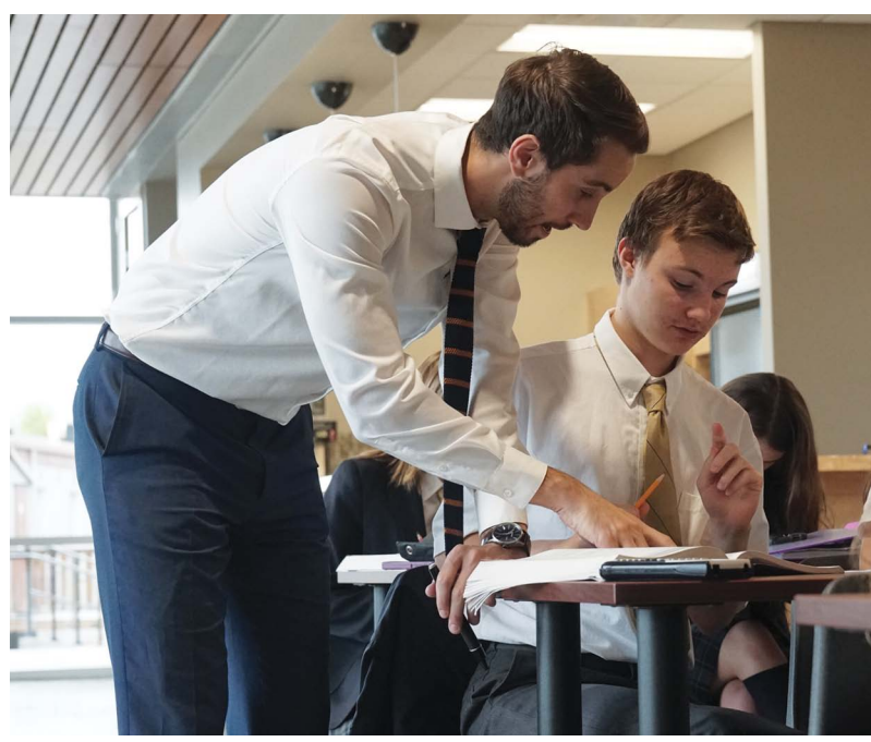
"It's about looking down the road... AND around the corner."