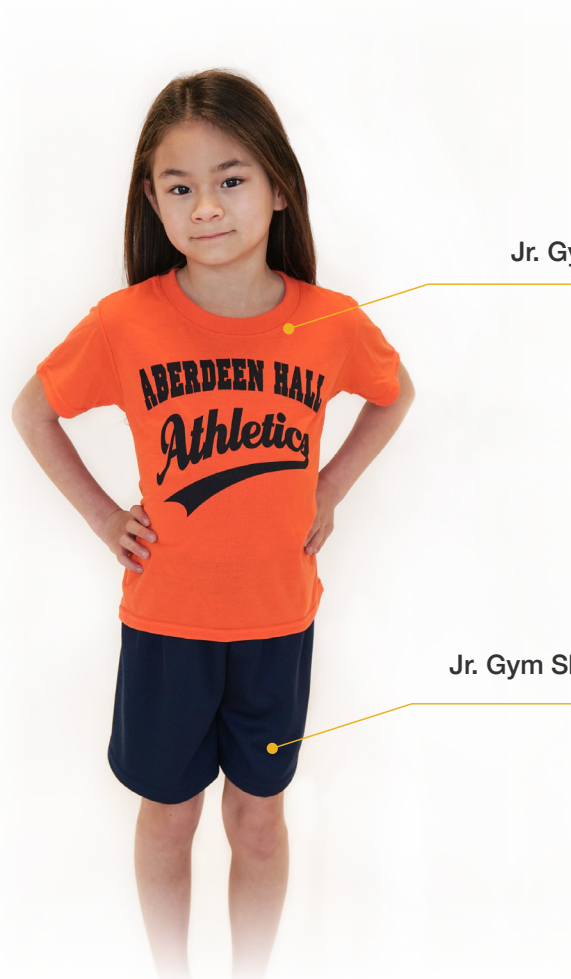
Jr. Gym Shirt