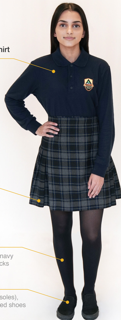
Crested Polo Shirt

*Shorts may only be worn until Thanksgiving and after Spring Break