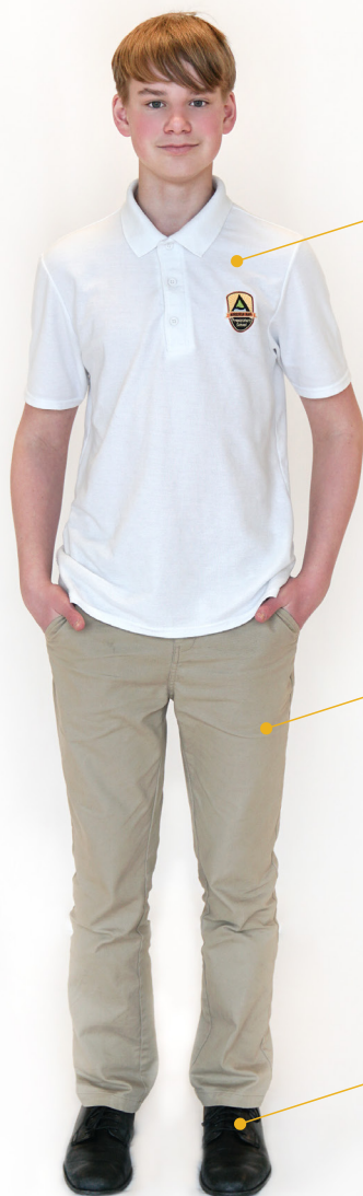
Crested Polo Shirt